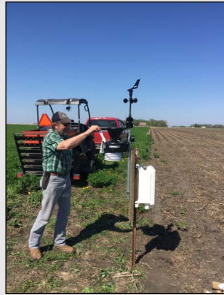
Soil Temperature & Moisture Research