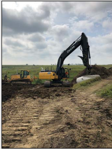
Seward 29 Embankment Repair