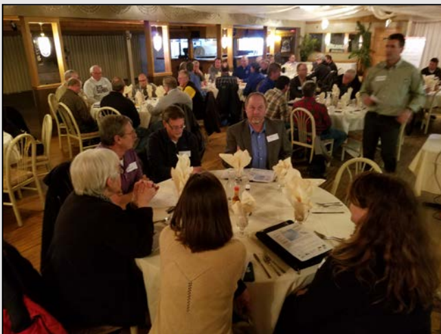
Water in Southwest Minnesota: It Affects You!