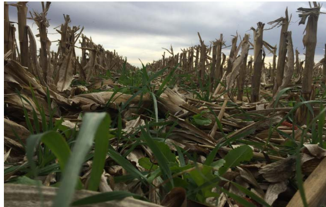
2015-2017 AVERAGE YIELD DATA IN COVER CROP FIELDS JACKSON AND NOBLES COUNTY, MN

To help determine the economics of using cover crops, data was collected from cover crop fields in Nobles and Jackson Counties for three years. The following data was used to determine the net profit: average field yield, revenue per bushel, cost of crop seed, cost of fertilizer, cost of chemicals, crop insurance, cost of using machinery (fuel, custom farming, rentals, etc.), and cover crop seeding, application and termination cost. Below is a chart of the averages from corn and soybean fields from 2015-2017 in both Jackson and Nobles County.