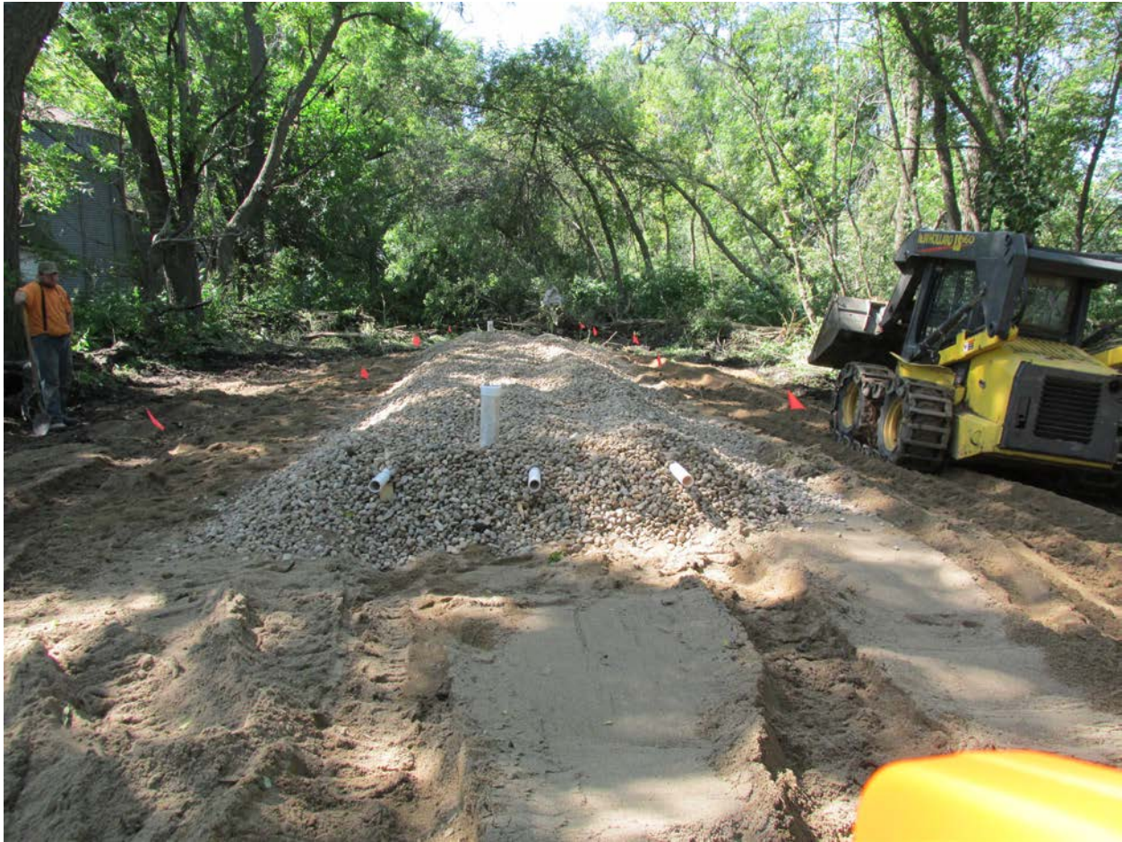
Description/location: Mound system installation, NE ¼ of Section 34, Bondin Township, Murray County